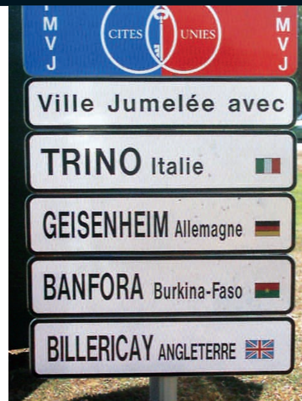
Twinning sign in Chauvigny, Vienne (France).

The town twinning arrangements signed just after World War II are at the origin of French decentralized cooperation. Following the Sahel drought in the 1970s, they took the form of humanitarian action. For some 15 years, local authorities have been developing international activities in their own fields of competence. They thus transmit their expertise in the implementation of public policies, such as decentralization, urban services management, the implementation of urban projects or regional planning. This field of action was recognized by the law of 6 February 1992 and the creation of the National Commission for Decentralized Cooperation within the French Ministry of Foreign and European Affairs for the support of external action by regional authorities. In France, all the regions, 80% of departments and 80% of municipalities of over 5 000 inhabitants are involved in decentralized cooperation with some 120 countries throughout the world. Action is focused essentially on French-speaking Africa, Latin America, South East Asia and China. The field is currently expanding to include Portuguese- and English-speaking Africa, Central Europe and India.