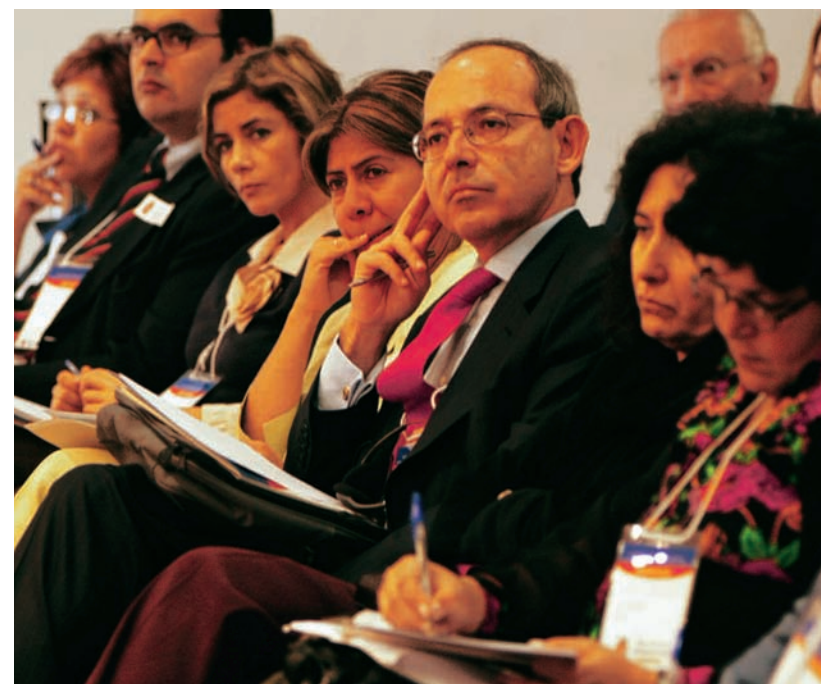
Left, from top to bottom:

The concept of decentralized cooperation, which emerged during the Lomé IV convention in 1989, expresses the European Commission's commitment to local forms of governance and the increasing participation of civil society. Decentralized cooperation, according to the EU definition, is not limited to relations established by regional authorities with their counterparts in developing countries, but also includes civil society. As such, decentralized cooperation can be maintained when relations between the EU and the State institutions of an aid-receiving country have been suspended for political reasons, as is the case in Myanmar or Haiti.