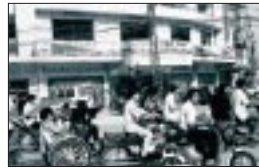
Urban services are the backbone of the city. Without them we cannot hope to reap any benefits from concentrations of people and activities.

Urban services are of vital importance both to companies and people because they order the smooth running and evolution of a city. They determine its development potential, the consistency of its territorial organisation, its ecological standards and the reality of its social cohesion.