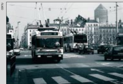
Urban transport is one of the fields in which French practitioners excel.

Efficient, fast and safe – urban transport systems contribute to the quality of life and the development of economic activity. But there is also a real risk of malfunctioning, which may give rise to all kinds of nuisance. Proper control of their design and operation is thus a central issue in urban organisation.