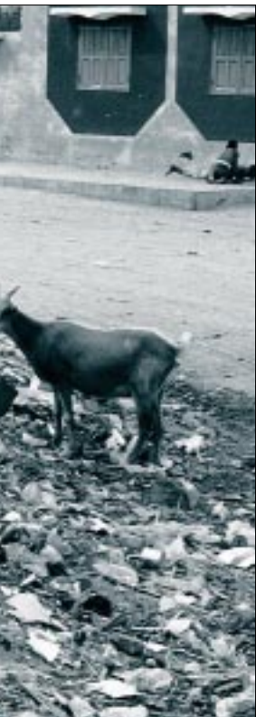
A.C.A. - B. Desjoux

ISTED "Cities" Section Chantal Barbieux 1 bis, avenue de Villars 75007 Paris - France Tel. 33 (0)1 44 18 63 94 Fax 33 (0)1 45 55 72 82 E-mail cbarbieux@isted.3ct.com