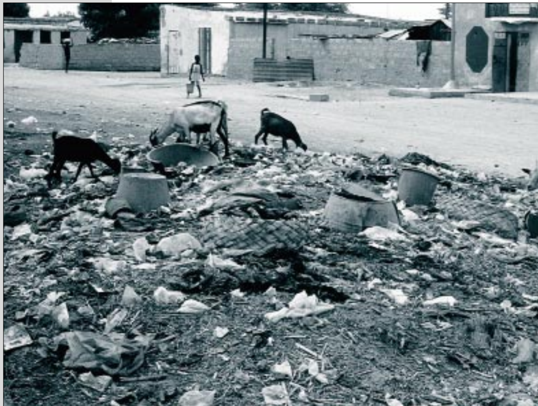
Waste management is often deficient in developing countries and suffers from a lack of strategies incorporating local constraints.

The mobilisation of French companies in this group, which is supported by French local authority representatives involved in decentralised development aid activities, is an essential means of reconciling development aid and economic aid. It will also be able to make use of other work on urban transport, and studies performed by the Ministry of Public Works on private financing of public facilities.