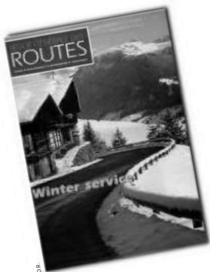
An offprint "Winter Service" (in English) published by RGRA for the International Congress in Luleå.

Note that this was nothing new to ISTED, which took part in the previous congress in Seefeld (Austria) in 1994, with a joint 72 m 2 stand.