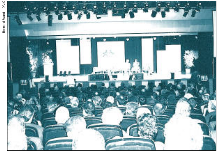
Three days of debates, conferences, workshops and a trade exhibition. A heavy programme for the 4 th Congress on Road Maintenance.

Congress participants: 1,600 Visitors: 10,000 Exhibitors: 220 Foreign delegations: 50 (143 people) Exhibition area: 10,000 m 2 Forum: 7 conferences, 15 debates, 12 workshops