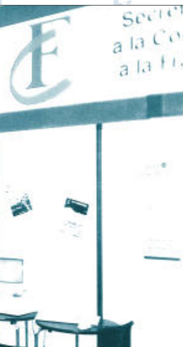
The French institutional stand at Africités 98, a very open area.